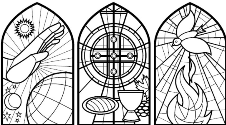
Colour in the Trinity stained glass windows.

When and where do we use the Sign of the Cross?