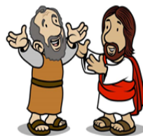
Draw the people celebrating and praising Jesus

The man was very happy because now he could hear and talk! The people praised Jesus.